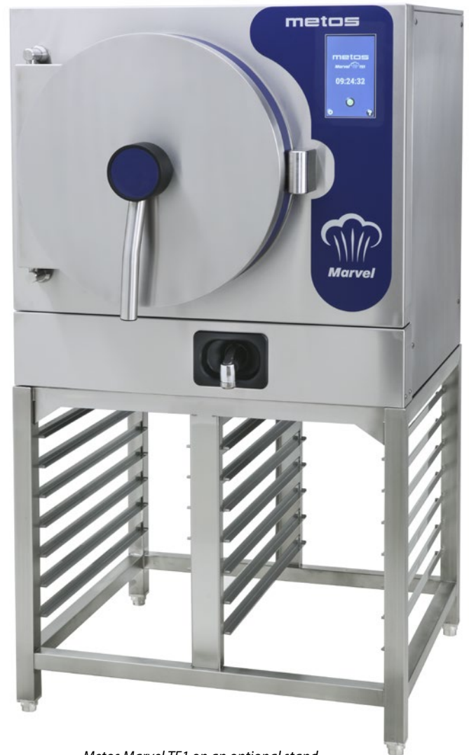
Metos Marvel TE1 on an optional stand.

With the Metos Marvel you can swiftly respond to changing demand and reduce losses. You can simultaneously make different dishes, since tastes and aromas will not transfer from one food to another.