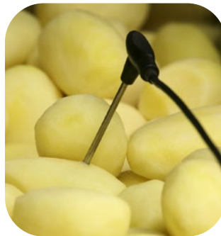
Optional core temperature probe for precise cooking.