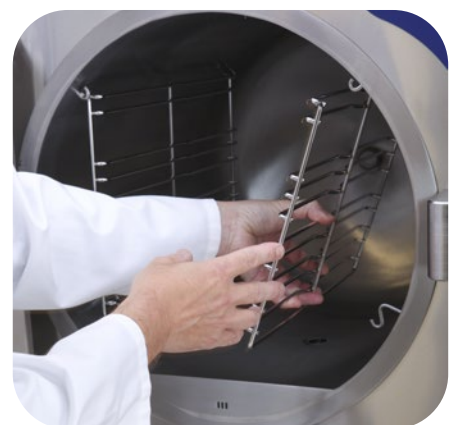
Easily removable GN guide rails help to clean the chamber. Integrated recoil handshower is an option.