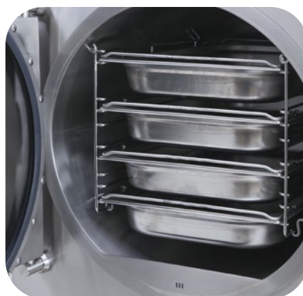
You can simultaneously make different dishes, cook 4x GN 1/1 65 mm or 3x GN 1/1 100mm pans at time.