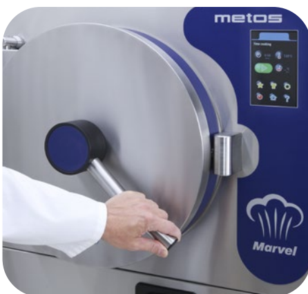
The easy grip door handle is designed for single hand operation