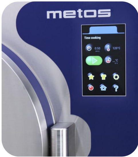
Multi-language Touch Screen interface