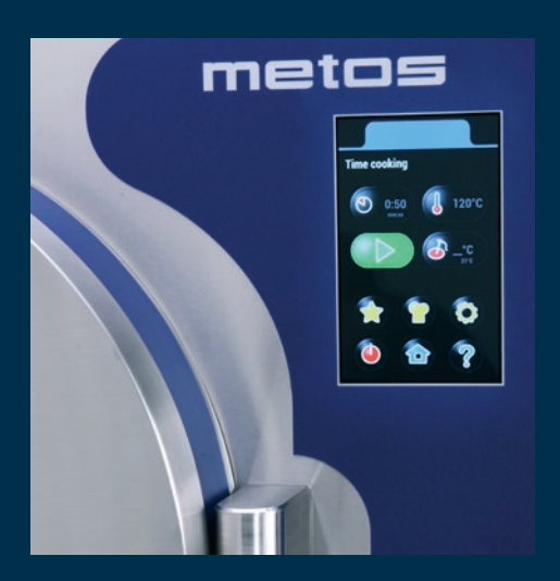
Multi-language Touch Screen interface

The Marvel can be installed on a GN stand with 2 x 7 GN rails.