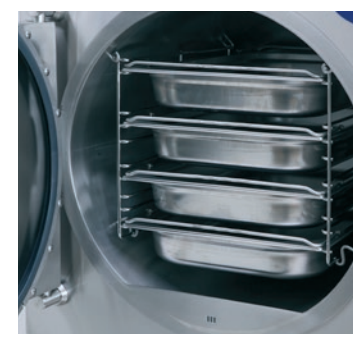
You can simultaneously make different dishes, cook 4x GN 1/1 65 mm or 3x GN 1/1 100mm pans at time.